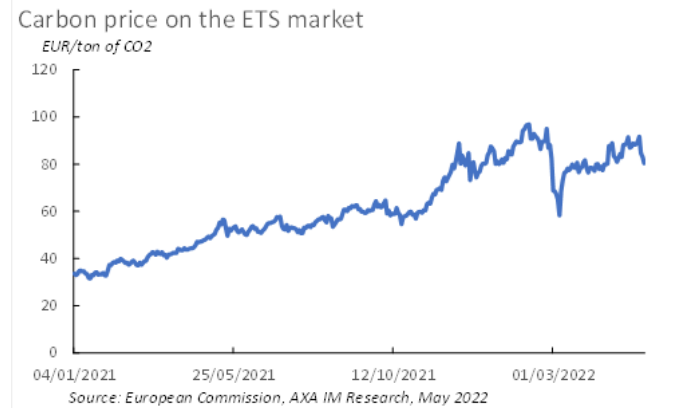
Exhibit 2 – Moving back from the right threshold

In a joint Op Ed with Bertrand Badré in Project Syndicate a few weeks ago we made the point that while the imperative of taking on board energy security concerns could justify some short-term drift in carbon emissions – e.g., because Liquefied Natural Gas emits more GreenHouse Gas (GHG) per calorie than ordinary natural gas – any strategy to wean the EU off Russian energy had to preserve the long-term imperative to get to “net zero in 2050”. In clear, the short-term drift would have to be offset by less emissions than initially expected in the medium term. Releasing unused emission permits would send the wrong signal, because lower carbon price today affects carbon emissions tomorrow. Corporates and financial institutions need a clear price signal to be able to accurately allocate capital towards decarbonization. An instrument to reduce its volatility – more signal, less noise – as the MSR will help, and it may become at times necessary to stop carbon pricing to overshoot the equilibrium level consistent with net zero by 2050. A too high price of carbon could end up being so immediately crippling for energy companies that their financial capacity to invest in the transition could be curtailed. But creating the impression that emission permits would be seen by public authorities more as a source of funding than as a way to create the right incentives for cleaner production could distort this price signal.