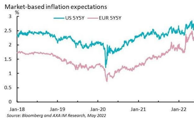
Exhibit 3 – More an issue for the ECB than for the Fed