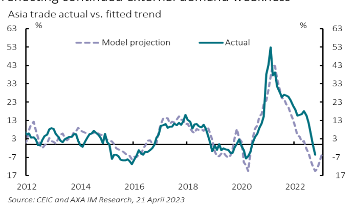
Exhibit 3: Regional export growth remains in contraction reflecting continued external demand weakness

Our in-house Asian export monitor continues to confirm this weakening trend in regional export growth (Exhibit 3). However, unlike previous months, many March advance estimators now hint at some improvement. The most recent outturn suggests a slight improvement from February, in turn implying that we could perhaps be nearing a trough in terms of the Asia export cycle. We expect export growth will remain in contraction territory until Q3 this year as external demand weakness persists — and measured in annual change terms impacted by last year's base effects.